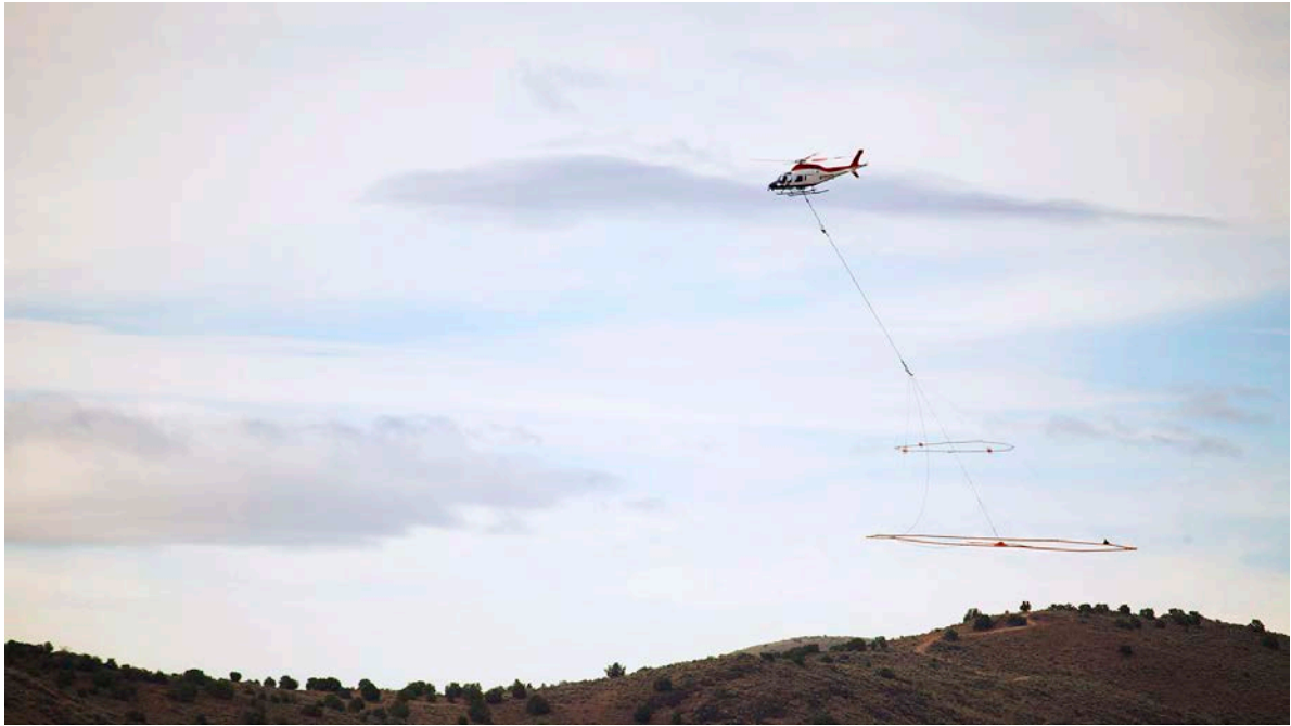
Figure 1: Helicopter-borne Versatile Time-Domain Electromagnetic (VTEM™ Max) geophysical system